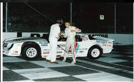
Matt Kenseth 1988 DRP Winner & 2003 NASCAR Champion

Thank You for this opportunity to introduce ourselves. We truly believe that with the thousands of fans that attend our events throughout the season, there is a real benefit in choosing Dells Raceway Park as a partner in planning a program for You.