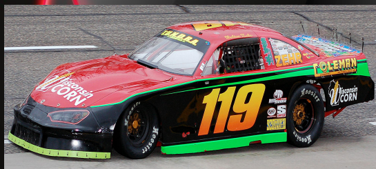
2019 Alive for 5 Series Champion Dalton Zehr