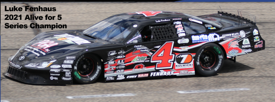
Luke Fenhaus 2021 Alive for 5 Series Champion