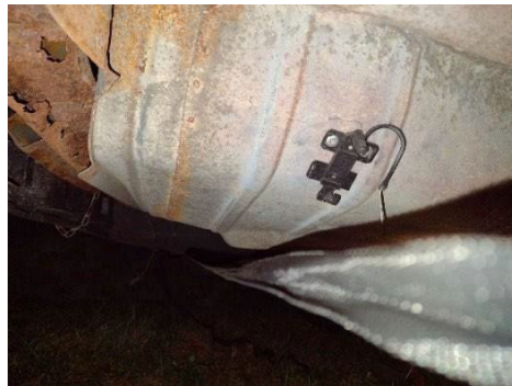
Transponders Available at the track for rent.