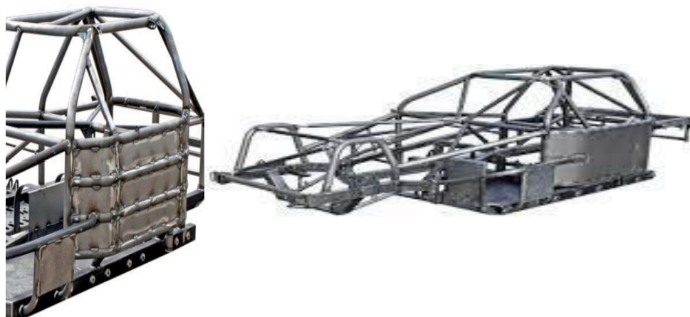
Illustration pictured below.

Plan B – minimum .090 thickness steel plate must be welded to the space between each left-side door bar. Offset chassis right side door bars commonly called the outrigger or the kick-up bar, must be constructed of a minimum 1.250-inch x .065-inch wall round or square steel stock. Front of outrigger bar must go to right front frame behind right wheel. All supporting substructure must be constructed of 1-inch x .063-inch wall round or square steel stock. No material substitutions permitted.